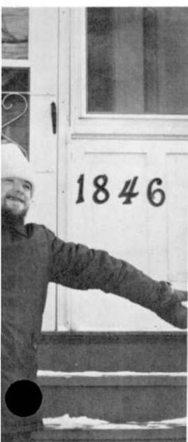
son (our house) group home