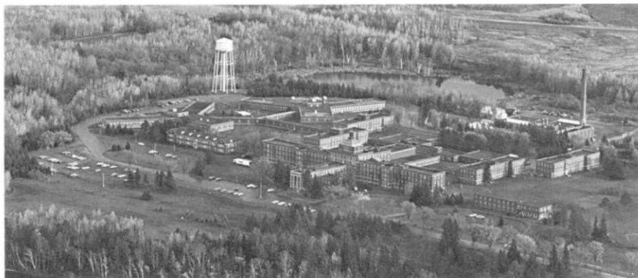
Ariel view of traditional institutional setting.