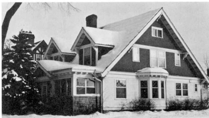
St. Paul based group home located in established neighborhood.