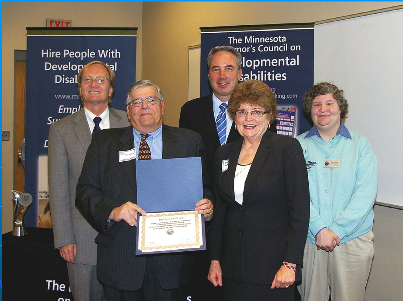
The Wallace Group