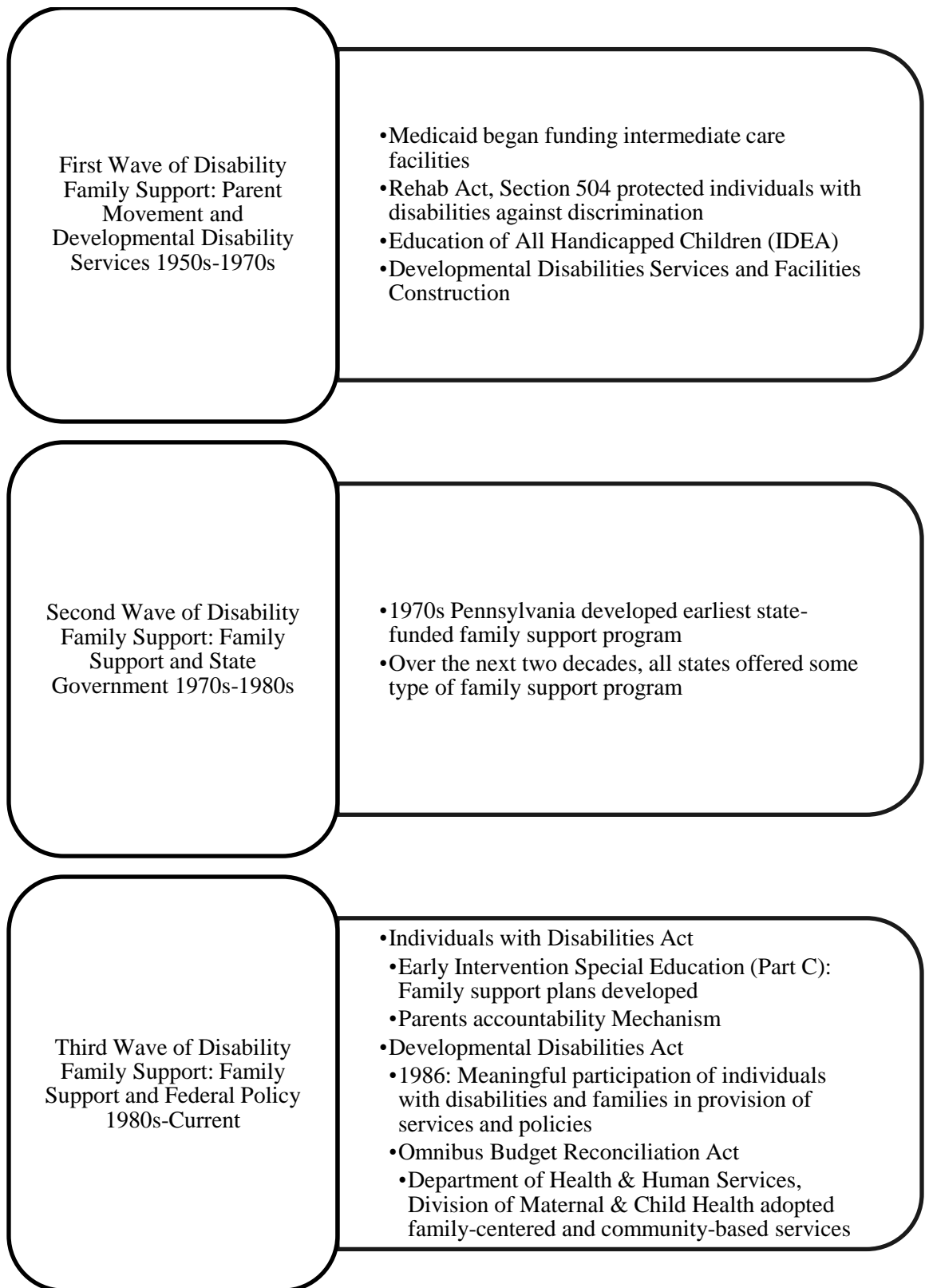
Figure 3: Progress of the Disability Family Support Policy