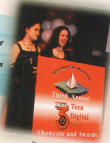
Teen Digital Reel Showcase