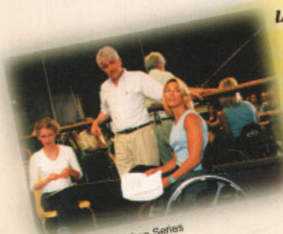
Theatron Workshop Series