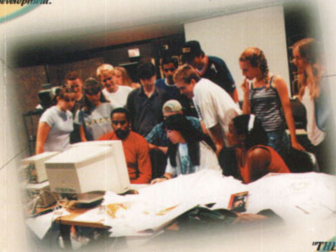
"THE wor ans tha lea