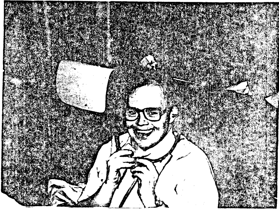
This is me on the plane.