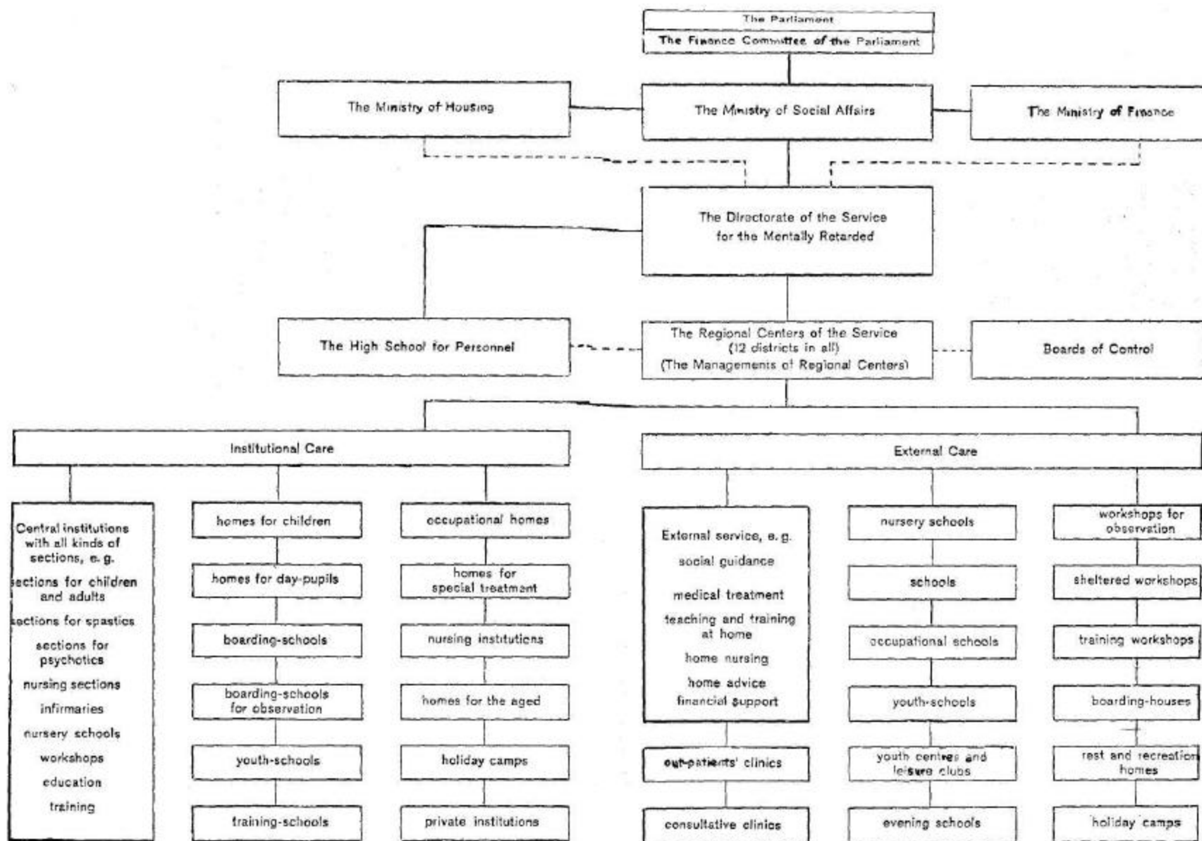
Figure 2: The organization of services to the mentally retarded