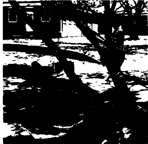
Dixon playgrounds feature well-known forms from nature and daily living